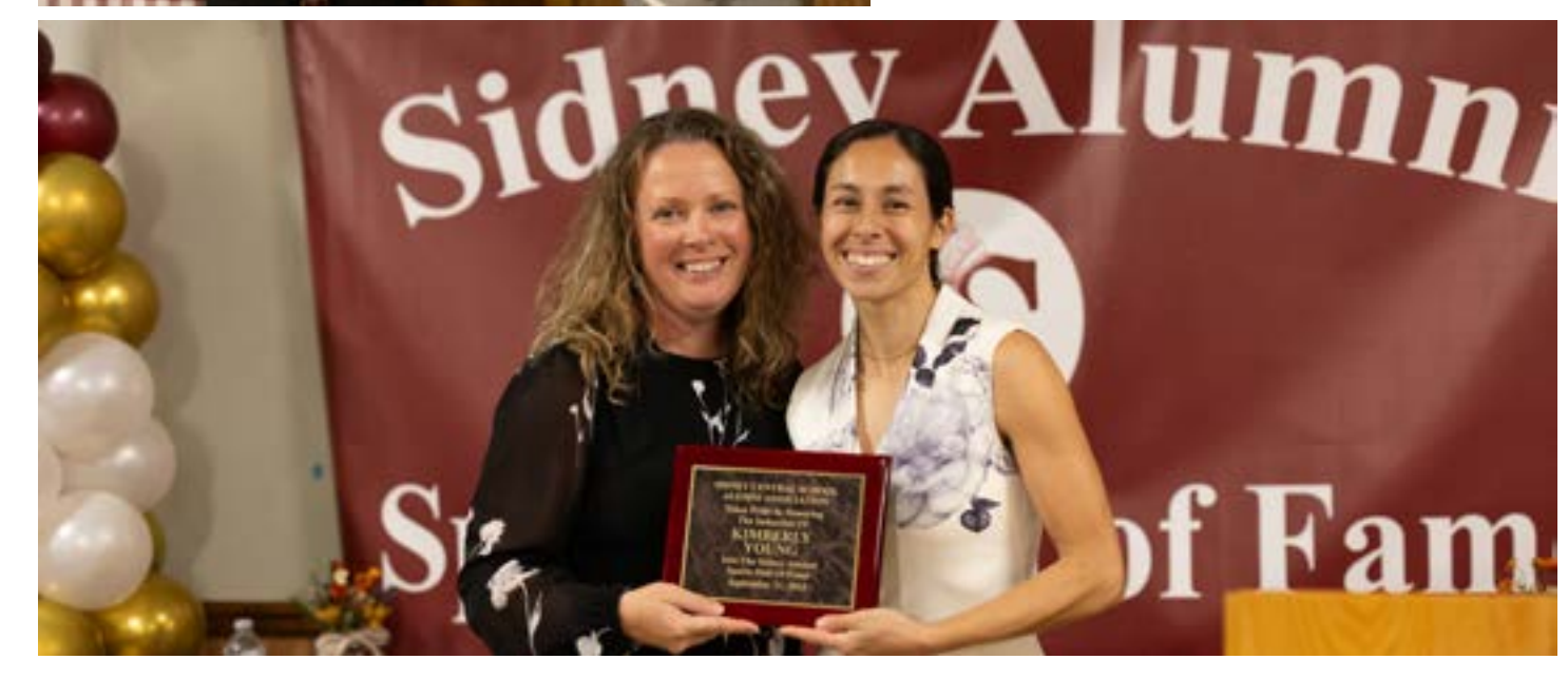
SHOF images provided by SCS student Cooper Harvey.