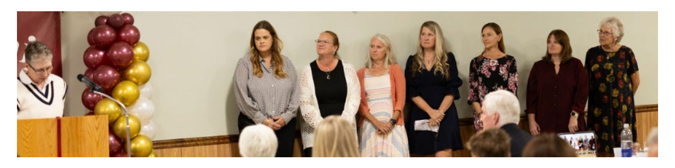
17th Annual Legacy Award